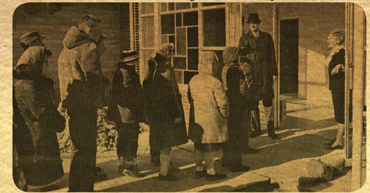
Bona Vista School on Laguna Street opens - 1965