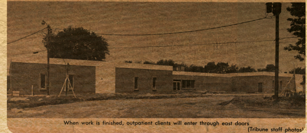
When work is finished, outpatient clients will enter through east doors