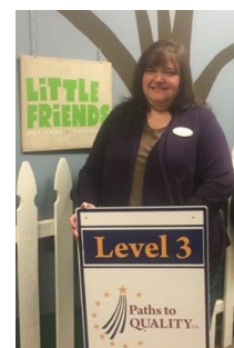
Little Friends Day Care