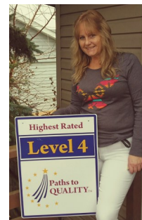
Coconuts Family Childcare