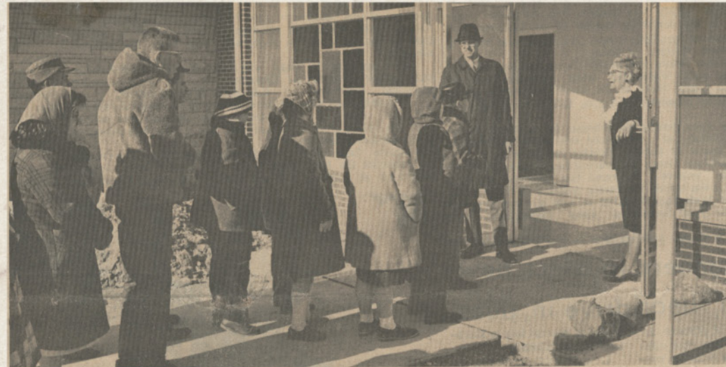
Bona Vista school opens here

We will celebrate each day leading up to our official birthday – Sept. 10 with a #60to60 special hashtag. There will be historical photos, special events and different ways that you can join with us as we celebrate. Be sure to follow us on Facebook, Instagram and Twitter for the most up-to-date information!